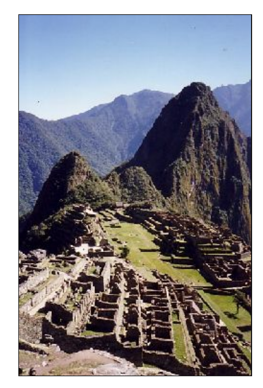
Discover the Inca Spirit